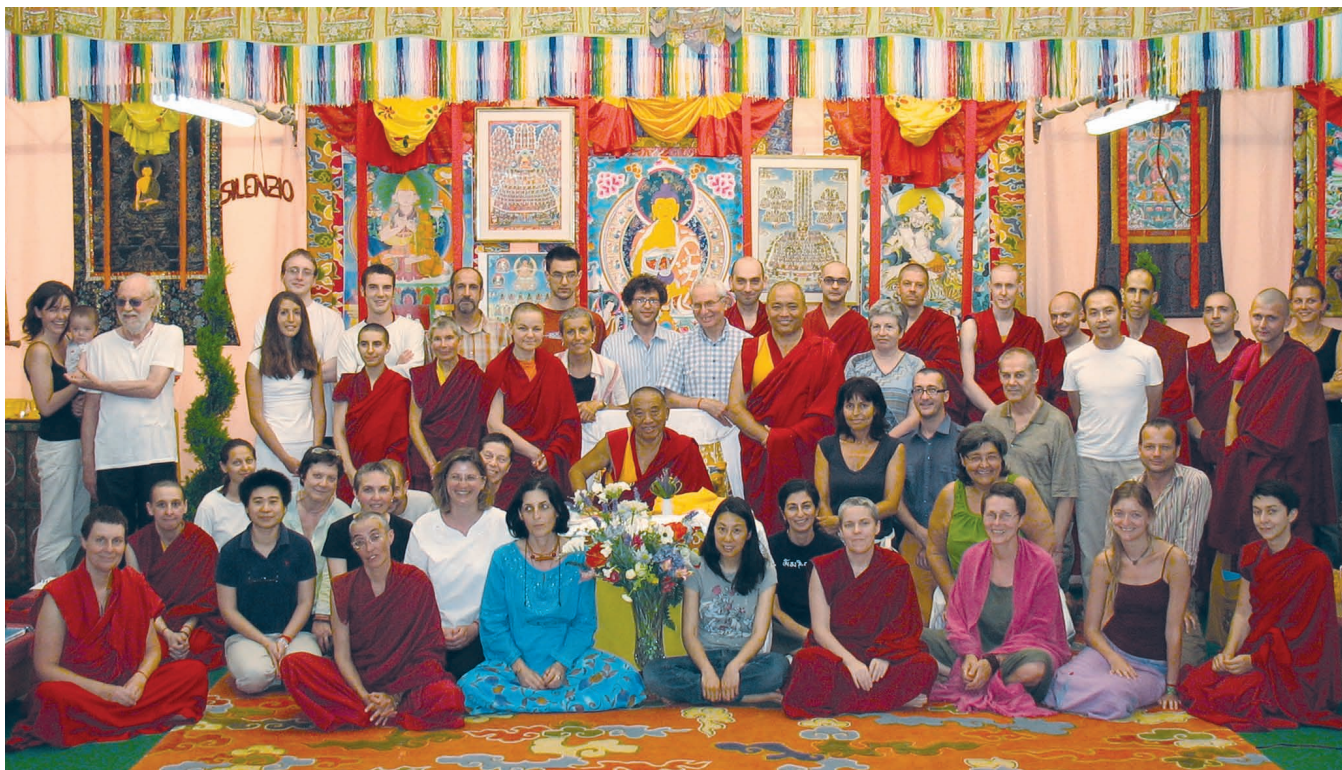
Clockwise from left: Basic Program graduates with Geshe Tashi Tsering, Chenrezig Institute, Australia, December 2007. Masters Program certificate, designed by Lama Zopa Rinpoche. Masters Program students with Geshe Jampa Gyatso, Istituto Lama Tzong Khapa, Italy, June 2007.