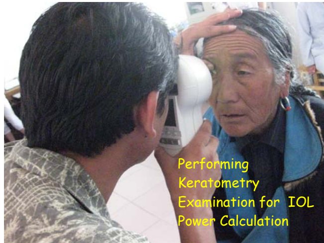
Performing Keratometry Examination for IOL Power Calculation

All the cataract patients underwent the investigation for IOL power calculation, one day before the operation day. The local hospital staff and LIEC team performed the blood pressure measurement, trimming of eye lashes, and administration of antibiotic and dilating eye drops into the eyes to be operated on.