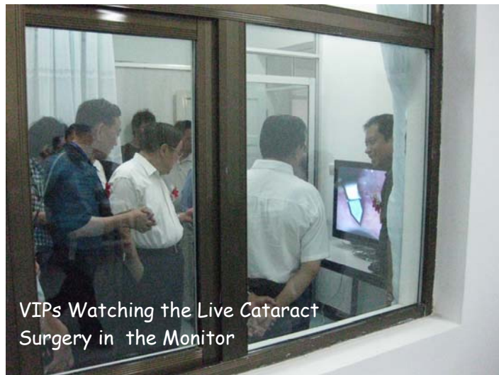
VIPs Watching the Live Cataract Surgery in the Monitor