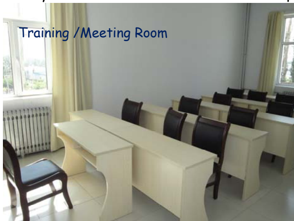
Training /Meeting Room

More than 50% furniture and accessories for building has been installed. Mostly of the administration rooms are equipped with required accessories.