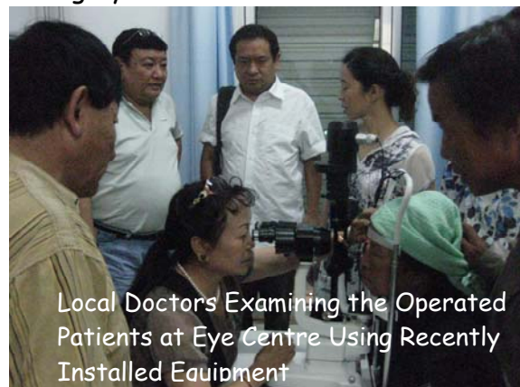
Local Doctors Examining the Operated Patients at Eye Centre Using Recently Installed Equipment

Two slit lamps for eye examinations have been installed in the examination room. The doctors examined the patients, who were to be operated on in that building, during the program. About 25 patients were examined on 24 th of