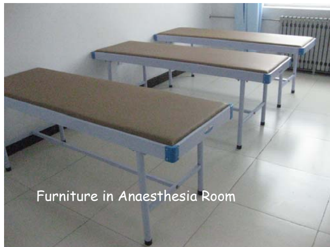
Furniture in Anaesthesia Room

The Centre has a well-furnished anesthesia room for the administration local anesthesia to the operation patients.