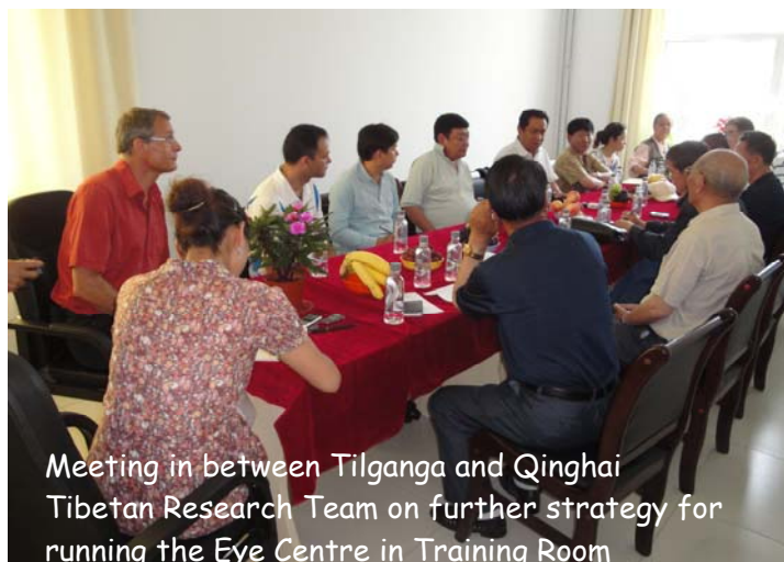
Meeting in between Tilganga and Qinghai Tibetan Research Team on further strategy for running the Eye Centre in Training Room

(ii) The second issue was development of the Eye Centre as a training