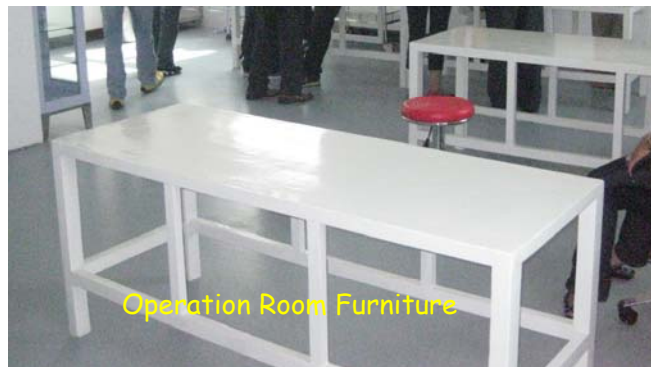
Operation Room Furniture

The Centre has its own operating table, instruments table, surgeons' chairs, electrical supply system, patients' beds for the anaesthetics room. Ophthalmic Technicians and ophthalmic nurses with the help of the local hospital staffs prepared the OR. Theatre preparation was done one day prior to surgery.