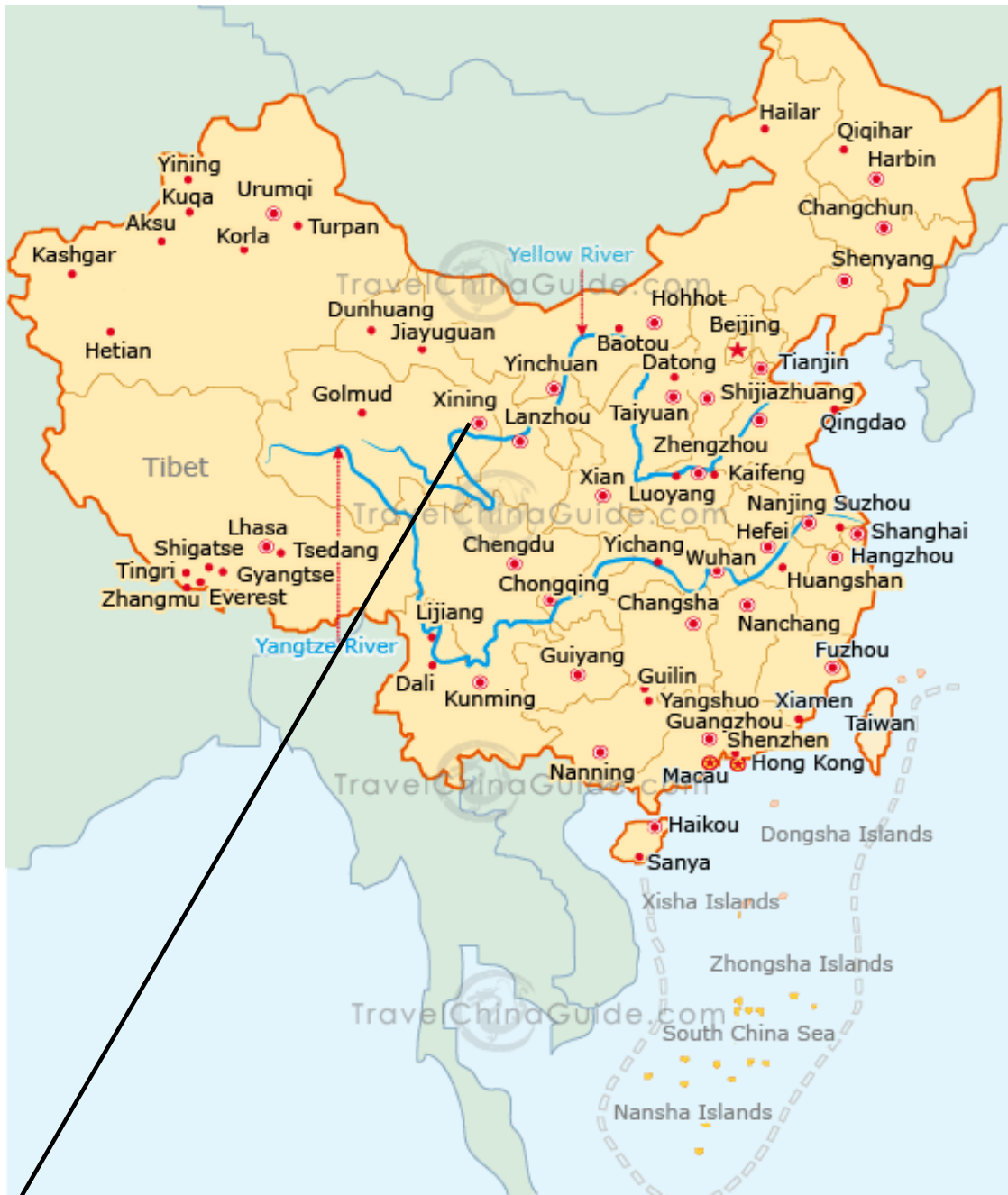
Qinghai Woesser Cataract Treatment Centre