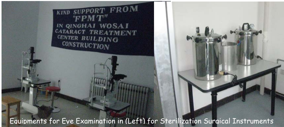
Equipments for Eye Examination in (Left) for Sterilization Surgical Instruments

More than 50% furniture and accessories for building has been installed. Mostly of the administration rooms are equipped with required accessories.