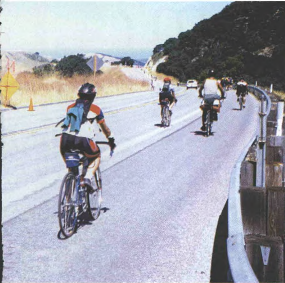
Along the Pacific Coast Highway

We cyclists in this great bicycle journey from San Francisco to Los Angeles were a diverse bunch united in our intention to support one another and to change a piece of the world in the process.