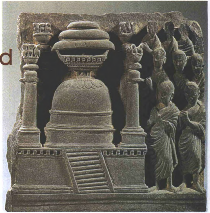
Monks worshipping Dona's Stupa. A fifth century sculpture from Gandhara

Behind the local sugar mill, one and a half kilometers from the pillar, lie the ruins of perhaps the biggest stupa ever built in India. Rising in a series of round, square and polygonal terraces, it is now only 24 meters high, but it has a circumference measuring nearly 457 meters. A small stupa was found deep inside, next to a page of Buddhist scripture dating from the fourth century C.E. Why was Lauriya Nandangar graced by both a pillar and such an enormous stupa? As with so many Buddhist sites, all records have been lost and we are left with a mystery.