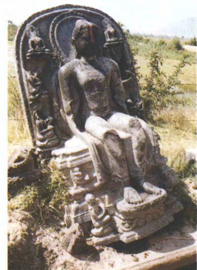
The Buddha statue at Jethian

A low, grassy mound at Jethian is what remains of this stupa. Beside it is a large pond that was formed by digging earth to make bricks for the stupa. On the side of the stupa is a beautiful statue of the Buddha about five feet high, sitting with his hands in the dharmachakra mudra, and surrounded by smaller buddhas. If you climb to the top of one of the nearby crags, you will be rewarded by a fine view over a countryside that has probably changed very little since the Buddha’s time. The modern name Jethian is a Hindi contraction of the village’s original name, Lativana, which means the ‘Palm Grove.’ From the top of any hill you will see palm trees growing everywhere around Jethian – it makes you realize how timeless India really is. ☸