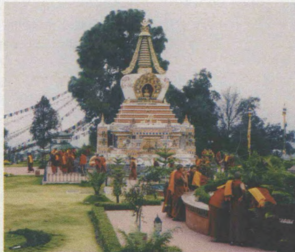
Pilgrims had a week-long retreat in Kopan.

One of the many striking aspects of this pilgrimage is that when you arrive at these historical sites, it's all there, just as you have heard in the stories – Ashoka's pillar, the pool in which Mahamaya bathed before the birth of her son 2,600-odd years ago. While the forest is not as dense as it once was, it is