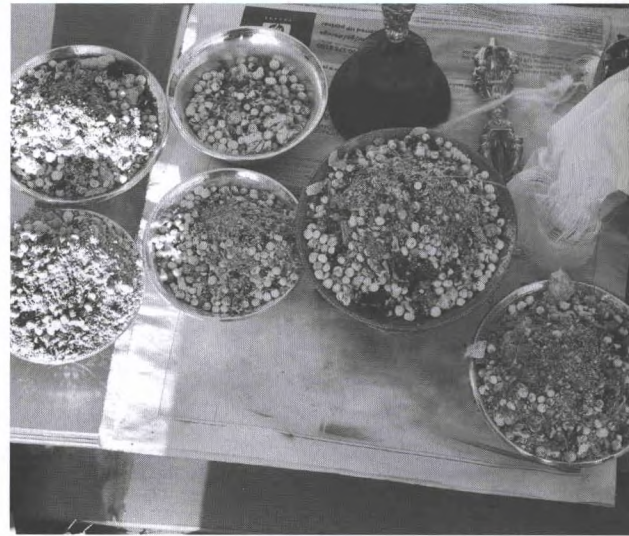
Relics are collected.