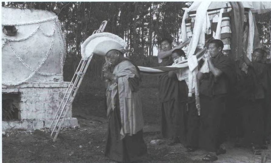
Lama Zopa Rinpoche in procession before the cremation.

us, he disappeared. It turned out to be Rinpoche! When we went to his room, I made three prostrations, and I was very surprised that immediately I was taken with him, without a single word spoken.