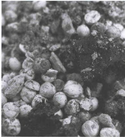
Relics pile inside the cremation stupa.