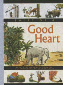
Book and DVD