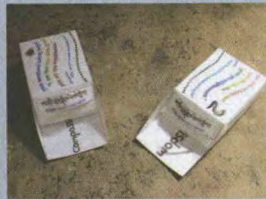
Lama Zopa Rinpoche designed these animal liberation tools: bug catchers decorated with mantras!