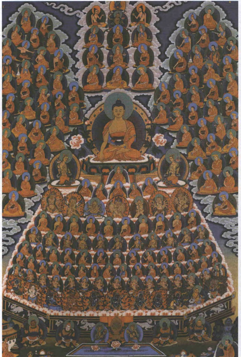
Depiction of a refuge merit field.

Taking refuge has so many benefits that we cannot enumerate all of them now but you can study them in the Pramanavartika ( Compendium on valid cognition , by Dharmakirti).