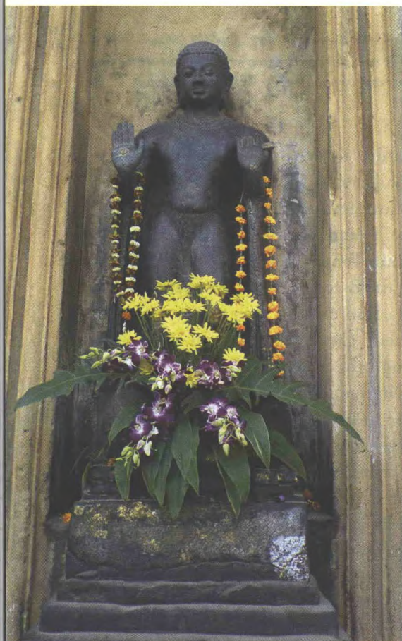
One of the many Buddha statues on the walls of the Mahabodhi Stupa.

Sitting during the afternoon tea break enjoying a cup of tea on the dining roof deck which overlooks the surrounding fields, watching the green grasses and tiny yellow flowers swaying in the wind, some Indian ladies walking by in their brightly-colored saris, the sound of the wind blowing through the trees, the birds squawking ... suddenly the world