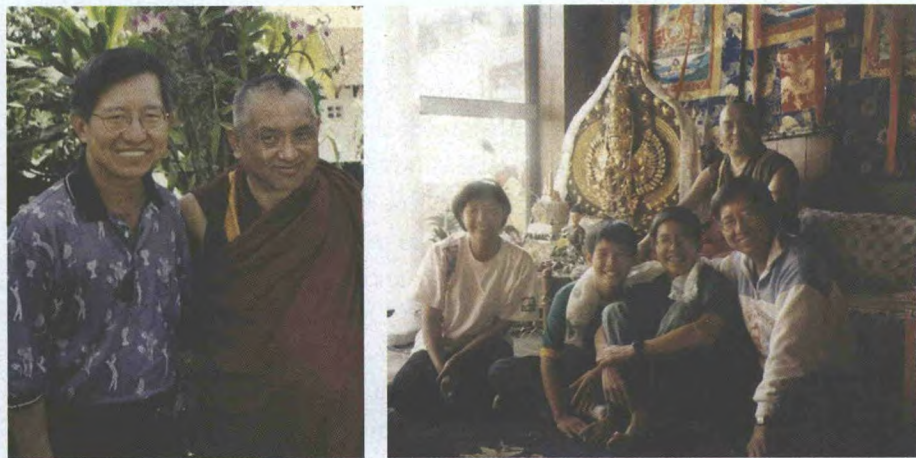
Left: Henry Lau with Lama Zopa Rinpoche in Kuala Lumpur, Malaysia, circa 2002.