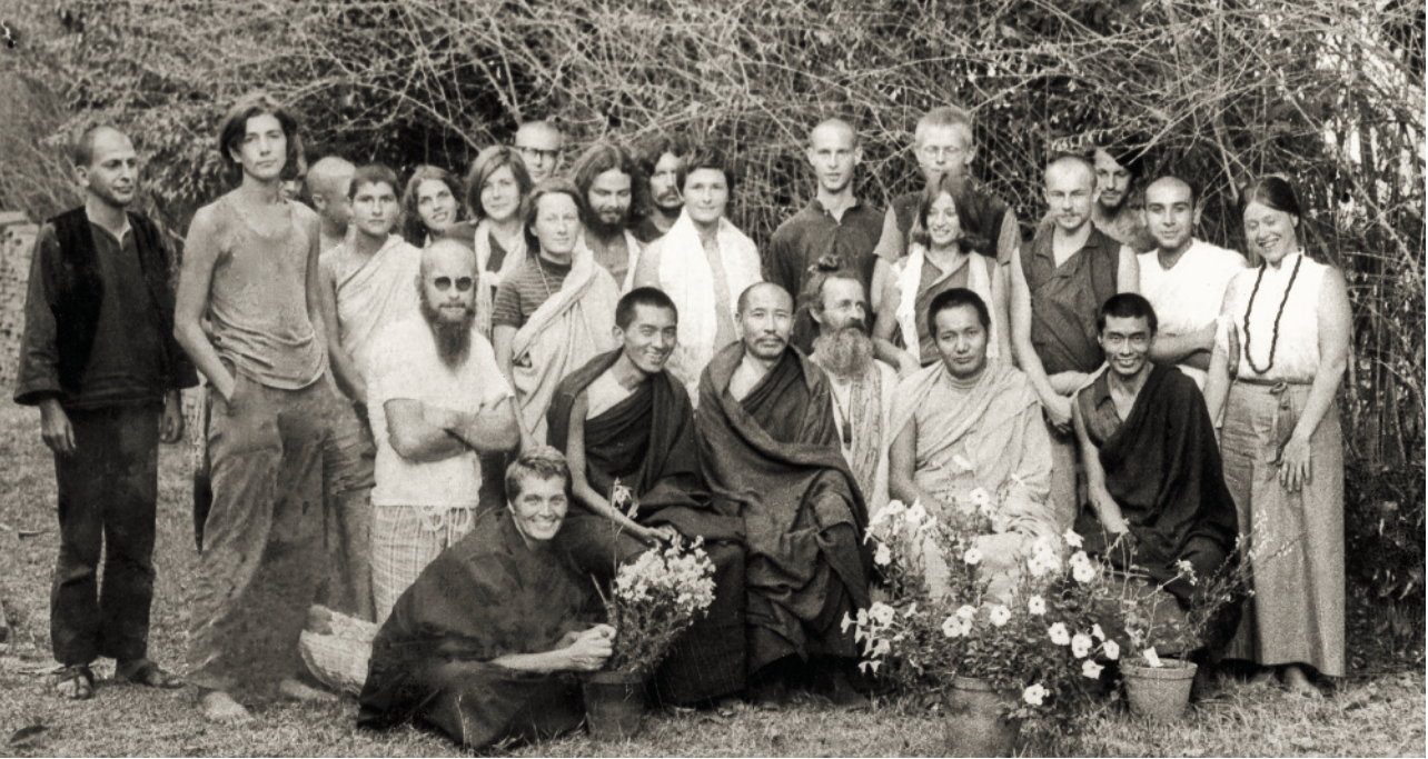
First Kopan course, 1971