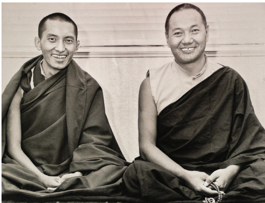
Lama Zopa Rinpoche and Lama Thubten Yeshe