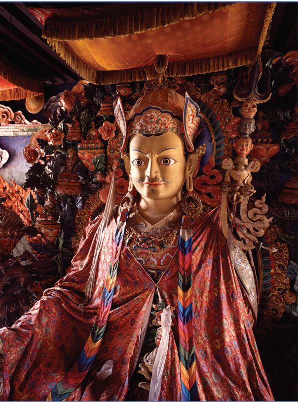
A Bhutanese representation of Guru Rinpoche, also known as Padmasambhava