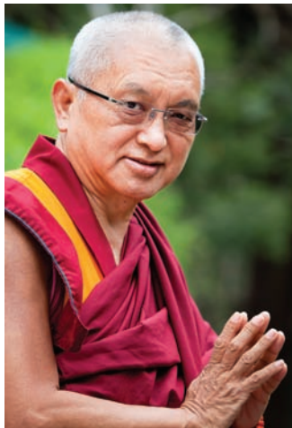
Lama Zopa Rinpoche in California, USA, February 2011.