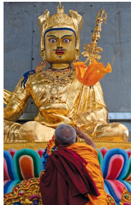
From left: Tent City at Atisha Centre; Lama Zopa Rinpoche with Guru Rinpoche statue at Great Stupa of Universal Compassion

it is awe inspiring. This is history in the making, akin to one of the great cathedrals of Europe being built. What an explosion of merit and good karma, an inspiration for generations to come.