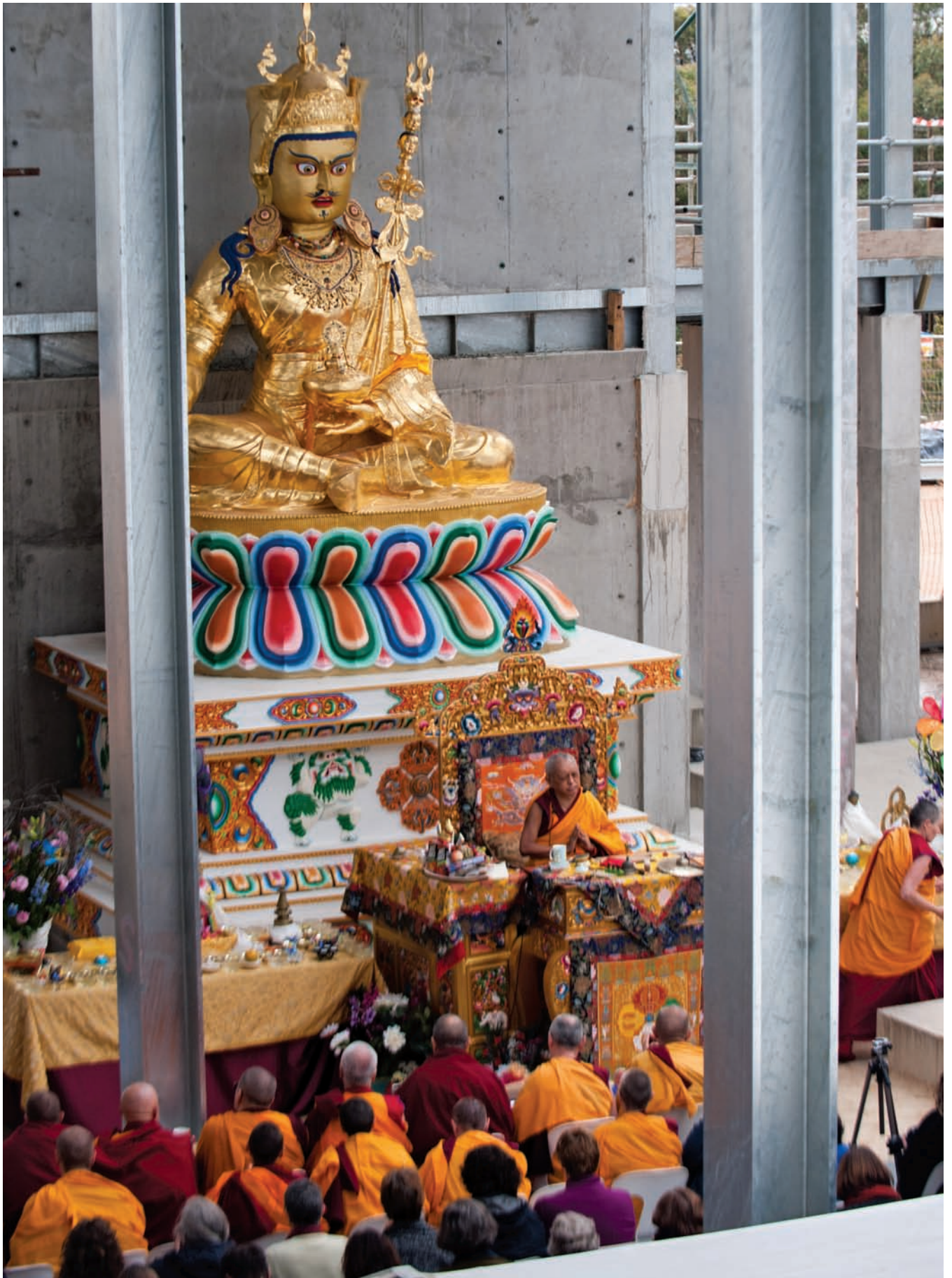
Guru Rinpoche statue at Great Stupa of Universal Compassion near Bendigo, Australia