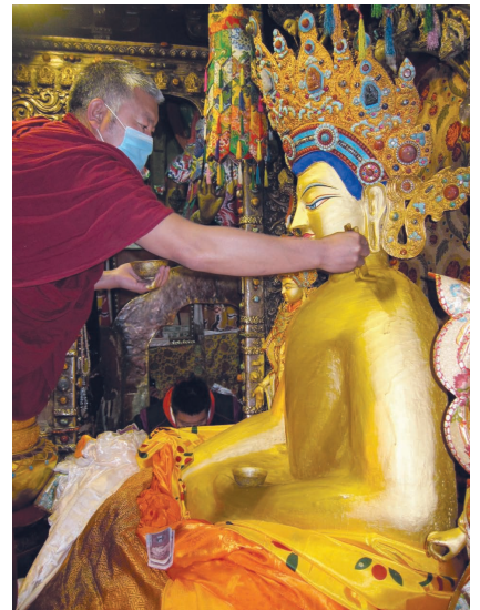
Offering gold to Jowo Buddha, Lhasa, Tibet

While making personal offerings at the holy sites in Nepal, Tibet and India may not be possible, offering to the FPMT Puja Fund affords Dharma students the opportunity to participate in continual offerings to holy objects and other auspicious activities organized around the world. ♦