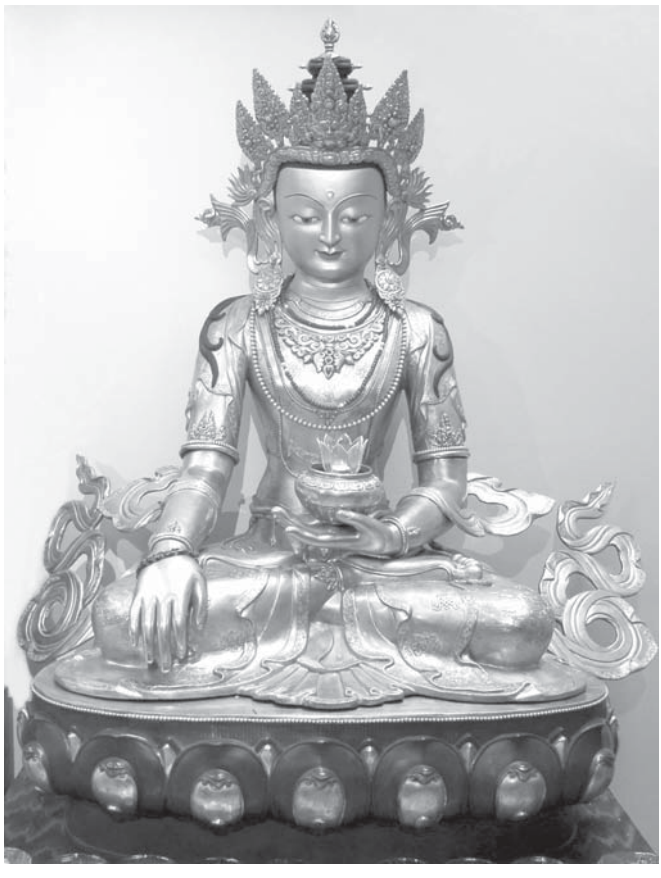
Statue of Guru Shakyamuni Buddha in Samboghakaya aspect, (copy of the Jowo Rinpoche statue in the Jokhang in Lhasa,) FPMT International Office

being born as an insect, much less being born a hell being, animal, or preta? When human beings have problems, they can communicate. They can try many ways to resolve the problems. But animals and pretas cannot do this, and their suffering is so much greater. They have unbelievable problems, so there is no question about the hell beings whose suffering is unimaginably heavier.