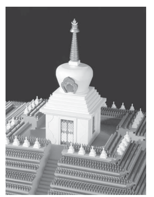
Model of the 100,000 Stupa Project being built at Land of Medicine Buddha, Soquel, California, USA.