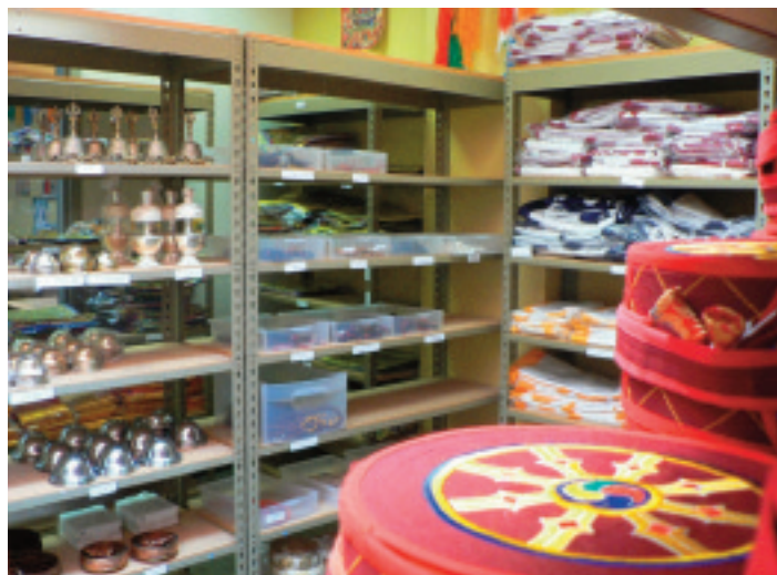
Shelves of meditation supplies in The Foundation Store

the physical location of The Foundation Store's staff and warehouse are also part of the FPMT building in Portland. They're just tucked discretely in the back of the building, behind an unmarked beige door.