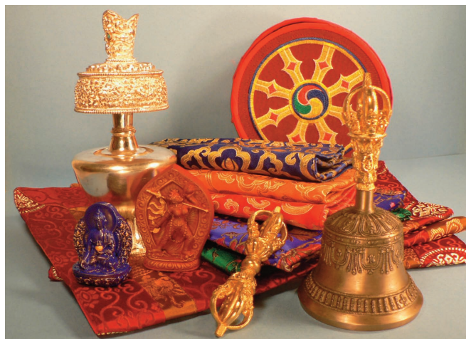
Meditation supplies and ritual objects from The Foundation Store

The Foundation Store stocks the entire collection of materials developed by FPMT Education Services . You can find practices spanning from the new publication Charity to