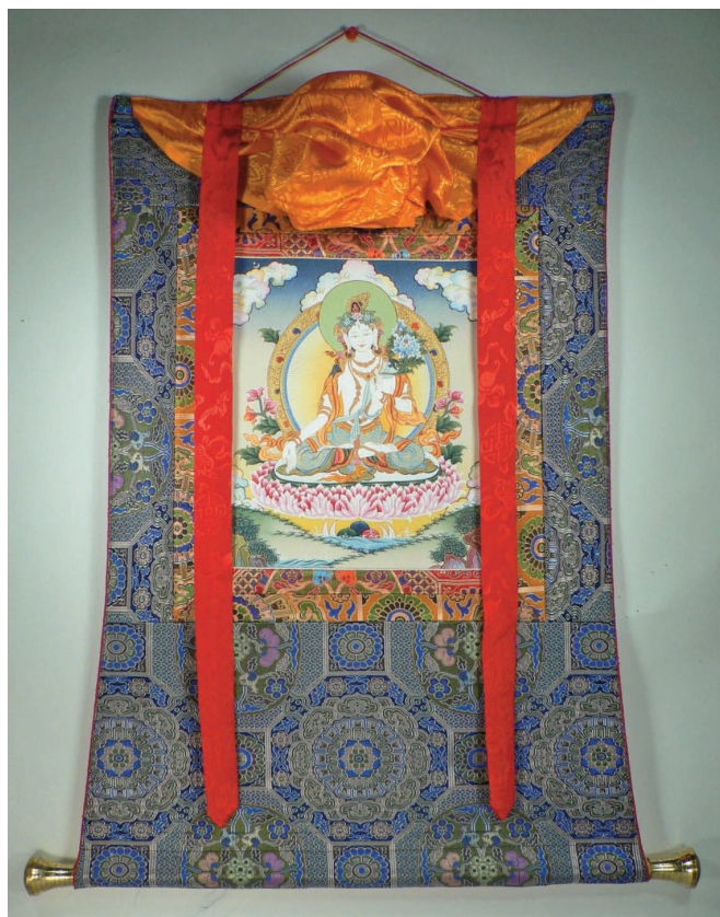
White Tara thangka

The Foundation Store buys items from about 30 vendors from around the world, with 95 percent of meditation supplies and ritual objects coming from Nepal. The store at Kopan Monastery in Kathmandu is FPMT's biggest supplier of practice items like brocade book covers, khatas and malas . They also supply prayer flags, door curtains, offering bowls, damarus, dorjes and bells , and several of the dozen or so varieties of incense that The Foundation Store stocks. The Kopan store uses the profits it makes from selling items to The Foundation Store to support the monastery.