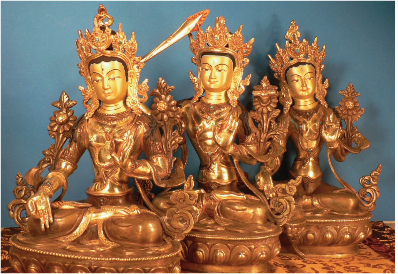
White Tara, Manjushri and Green Tara copper statues

May our Dharma publications spread all over the world and in every corner of the world.