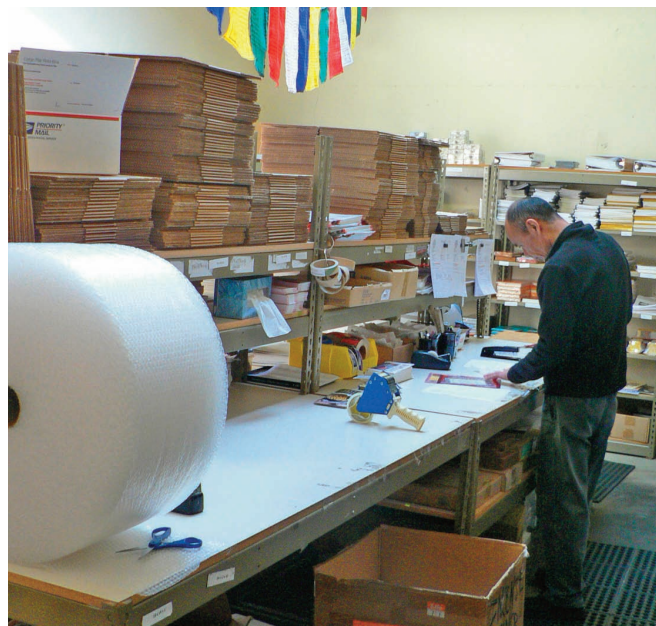
The Foundation Store ships Dharma materials worldwide

The success of The Foundation Store is like that of so many FPMT activities; students saw an opportunity to spread Dharma and took action. From the seed idea of making a book of Buddhist prayers more widely available, The Foundation Store organically blossomed. It's growth and success benefits not only the organization and its centers, but students who live far from qualified teachers; artisans and craft people in Nepal who create the statues, incense and other ritual items that the store sells; the sick and dying who are helped by the Liberation Box; all the beings who see the holy images