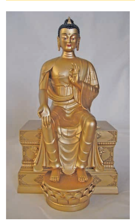
Statue of the future Buddha, Maitreya.

A Buddhist statue represents the holy body of a buddha.