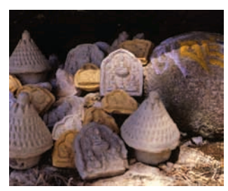
Tsa-tsas in Bhutan.

Tsa-tsas are a form of Buddhist art that has flourished for centuries in the Himalayas, most notably Tibet. Like many Tibetan sacred objects, they are iconographic forms of various buddhas.