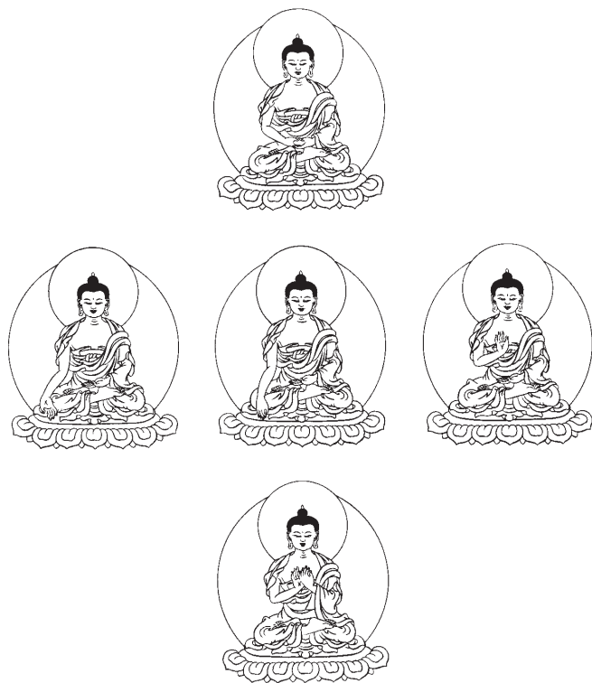
The Five Dhyani Buddhas