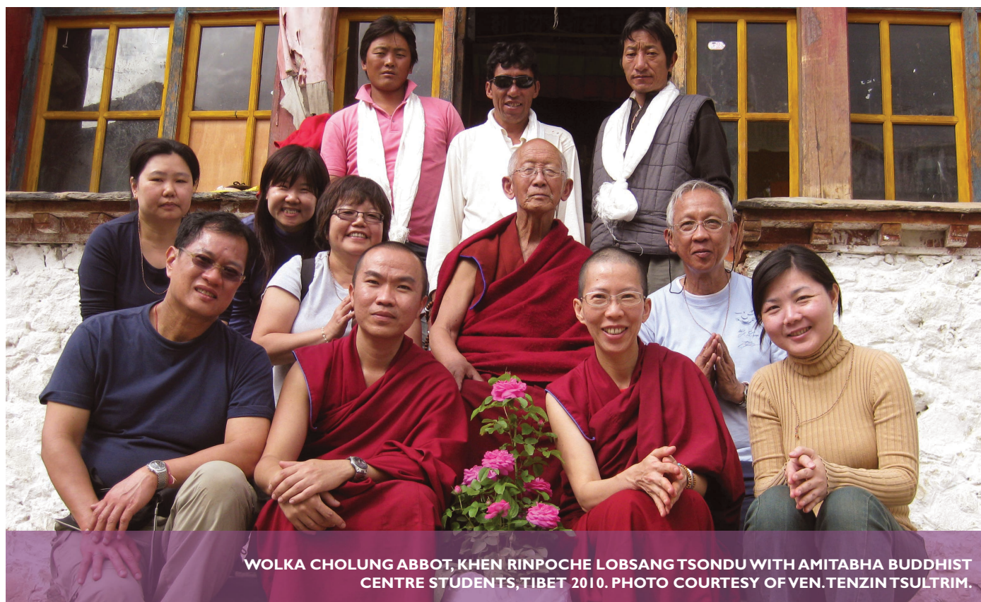
WOLKA CHOLUNG ABBOT, KHEN RINPOCHE LOBSANG TSONDU WITH AMITABHA BUDDHIST CENTRE STUDENTS, TIBET 2010.

Lama Atisha's Protection Stupa is available as a pre-folded amulet and as a PDF download through the Foundation Store ( shop.fpm.org ).