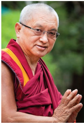
Lama Zopa Rinpoche in California, USA, February 2011.