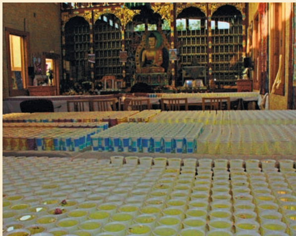
5,000 plastic cups were filled with offerings.

There were creative thinkers working on ways of beautifully arranging kilo upon kilo of every kind of brightly colored candy, the most perfect and delicious fruits, and strings and nets of fairy lights of every color to hang from anything hang-able, as a small army of people assembled the water offerings by dancing a