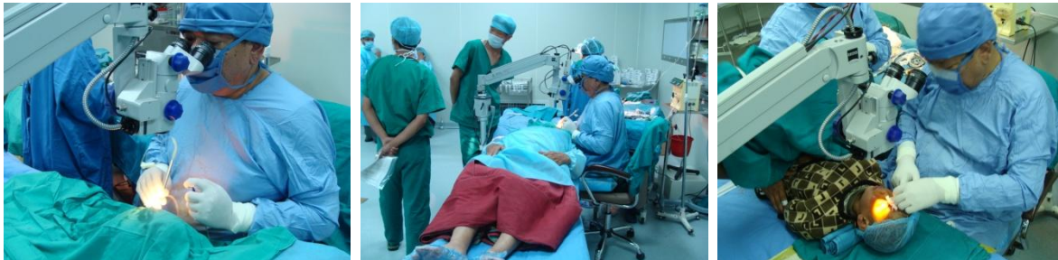
Dr. Sanduk Ruit performing eye cataract surgeries

The main purpose of the hospital is to offer low cost and if possible free cataract eye surgeries to all.