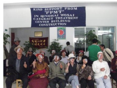
Dr. Sanduk Ruit (4 th from left) at the inauguration of the Amdo Eye Hospital building July 2010

It has three office rooms for the board members and an office and bedroom for Dr. Ruit for when he visits to train the staff.