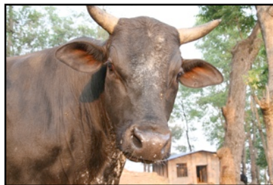
Yamantaka, the Sanctuary’s big bull

thing could be improved. Kopan renovated the animal shed in