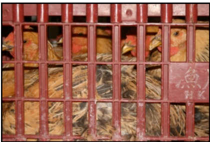
Top: Tamdrin with blessing cord from Rinpoche.