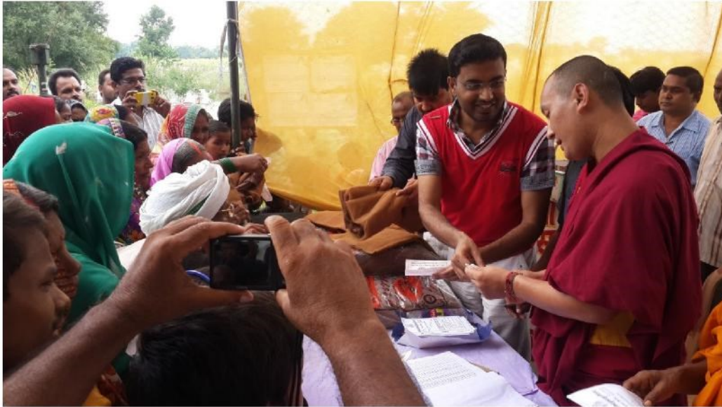
District Magistrate Kushinagar, and Lama conducting the distribution