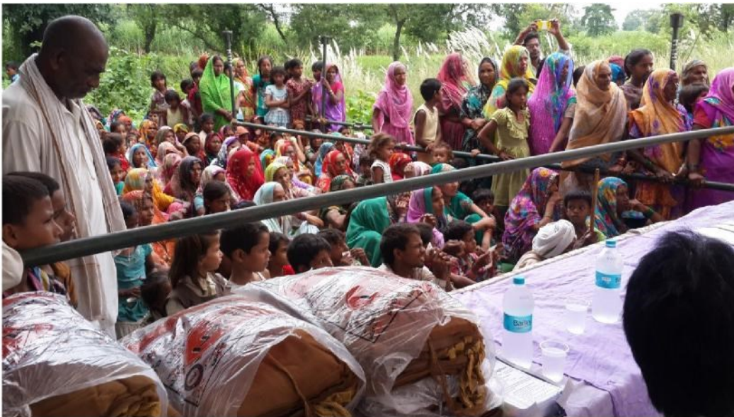
Villagers lining up to receive mosquito nets

Hundreds of people lined up in orderly fashion to receive their nets and the event was extremely successful. The Project will distribute an additional 2,500 nets during October 2014.