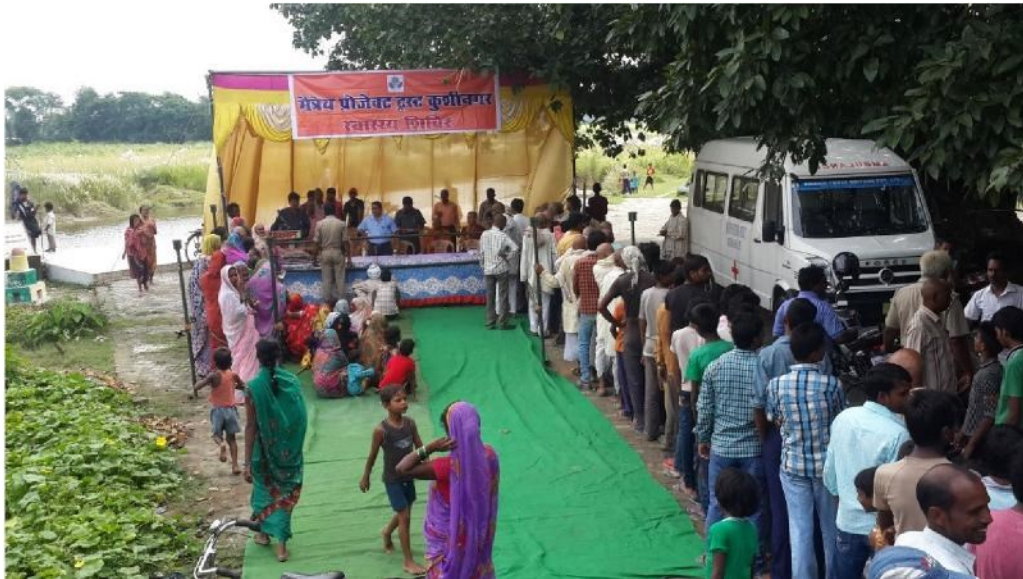
Maitreya Project Health Camp –mosquito net distribution with MPT mobile clinic van parked alongside

September saw the commencement of the Maitreya Project Health Camp and anti-malaria program. With the kind assistance of the Kushinagar District Magistrate's Office, the Project distributed an initial 1,000 mosquito nets together with pamphlets giving advice on malaria and other disease prevention. Eligible families received tokens against which they collected their nets.