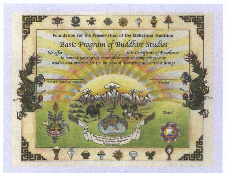
The well-earned Basic Program Completion Certificate has been awarded to 22 students.

For more information about the Basic Program and a full list of centers offering the Program, go to www.fpmt.org/education/bpdescription.asp; for the Masters Program go to www.fpmt.org/education/mpdescription.asp (www.iltk.it/mp/)