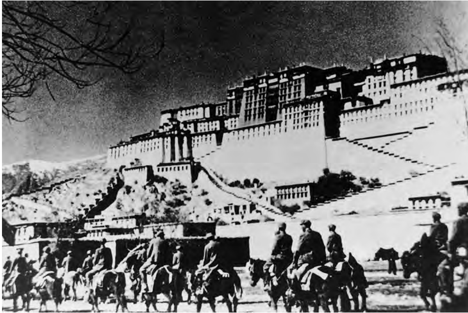
Chinese troops beneath the Potala Palace, 1951.

limitless ways, and the multitude of teachers who teach, or assist teaching classes in FPMT centers worldwide.