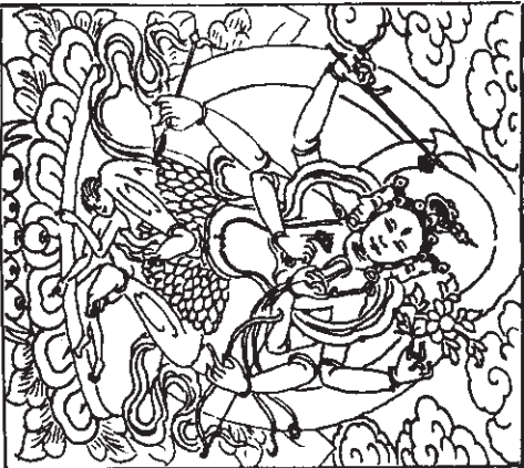
Loma Gyömma Woodblock print

This completes the exalted King Mantra of the Great Breath.