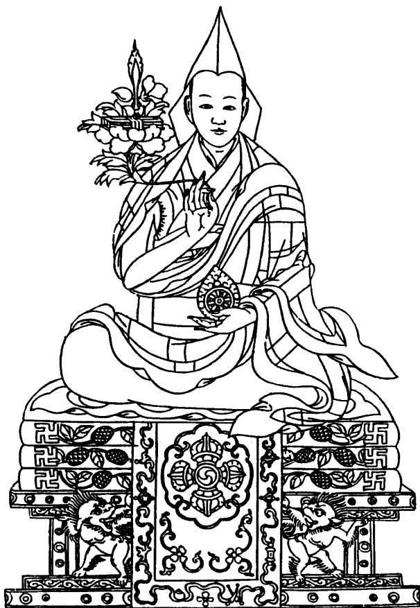
His Holiness the XIV Dalai Lama