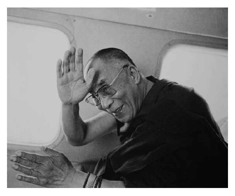
Please dedicate for auspiciousness that this is His Holiness returning to Tibet

Composed and translated by Lama Zopa Rinpoche